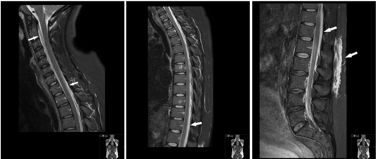
Fig. 2 Sagittal MRI STIR sequence of cervical, thoracic, and lumbar spine showing an extensive and widespread epidural hematoma reaching from occiput to L5, with a width of approximately 4–5 mm at the thoracic region and 3–4 mm at the lumbar region. The liquor space is compressed to approximately 1 mm in width. No intra-med-

ullar signal changes. A subcutaneous edema is also seen at the level of Th12-L3, likely a consequence of pressure on the soft tissue as a consequence of the patient being bedridden. MRI, magnetic resonance imaging; L, lumbar vertebrae; Th, thoracic vertebrae; STIR, short-TI inversion recovery