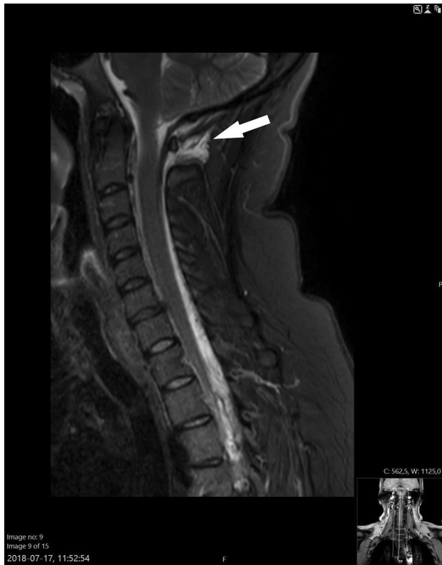
Fig. 3 Minor liquid collection (arrow) in the posterior aspect of the C1 to C2 vertebrae of the cervical spine. Sagittal MRI in STIR sequence. C, cervical vertebrae; MRI, magnetic resonance imaging; STIR, short-TI inversion recovery

The physically demanding exercise of child labor and a Valsalva maneuver could lead to increased intra-abdominal pressure that in turn could cause spontaneous rupturing of the epidural vessels. It is possible that the sudden onset of pain that the patient experienced during the end-stage of delivery corresponds to the extravasation of blood in the epidural space. Jacob et al. describe a middle-aged woman with spinal vasculitis resulting in an acute epidural spinal hemorrhage which first presented with a sudden non-traumatic onset of stabbing back pain followed by headache [23], although it has also been argued in the literature that patients presenting with SEH postpartum usually do so days or weeks after delivery, suggesting that the pregnancy-induced dilation of epidural vessels, rather than the mechanical straining of labor, is the predominant cause of SSEH in pregnancy [1].