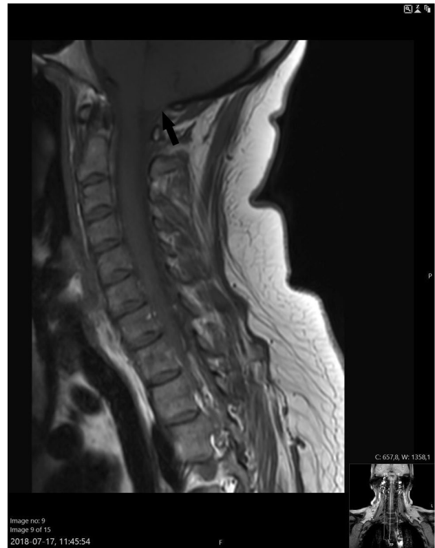
Fig. 4 A reduced amount of cerebrospinal fluid surrounding the cerebellum and medulla parenchyma (arrow) is why a mild form of sagging brain cannot be excluded. Sagittal T1 weighted MRI. MRI, magnetic resonance imaging

A traumatic mechanism such as a minor bone fracture induced by mild trauma, for example, by neck distortion during active labor, could explain the sudden onset of neck pain. Due to the patient's RA, thrusting the chin against her chest was associated with discomfort. There were, however, no direct signs of fracture or indirect signs such as bone edema in the vertebrae (Fig. 2). Even though micro-fracturing of the vertebrae cannot be fully ruled out, it is unlikely to cause